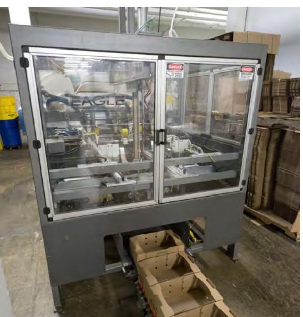
Supplied by WeighPack Systems and manufactured by Eagle Packaging Machinery, the high-speed VASSOYO Air trayforming system can achieve speeds of up to 25 cycles per minute at the Bercy Foods plant in Montreal.