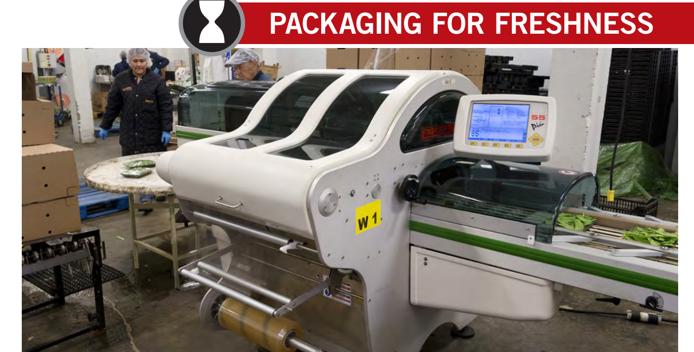
The Fabbri Model 55 Plus shrinkwrapping machine from Reiser can overwrap up to 55 containers per minute.

One of the newest pieces of equipment at Bercy Foods is a Fabbri Model 55 Plus shrinkfilm packaging machine supplied by Reiser Canada and installed in September of 2015.