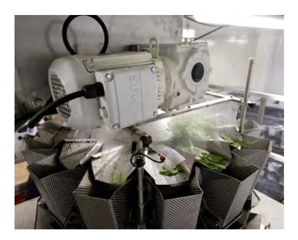
An SEW-Eurodrive motor provides smooth power distribution to the Bercy plant's weighscales.

"Lastly, in order to preserve our guarantee of quality and freshness, Bercy Foods packs its products and delivers them fresh daily to our customers, so that the consumer can always be assured that they are purchasing a genuinely fresh product."